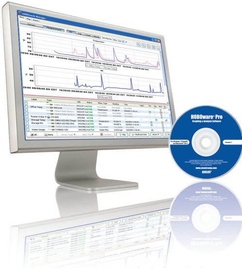
HOBOWare Pro 3.0 is included with the ZW Receiver